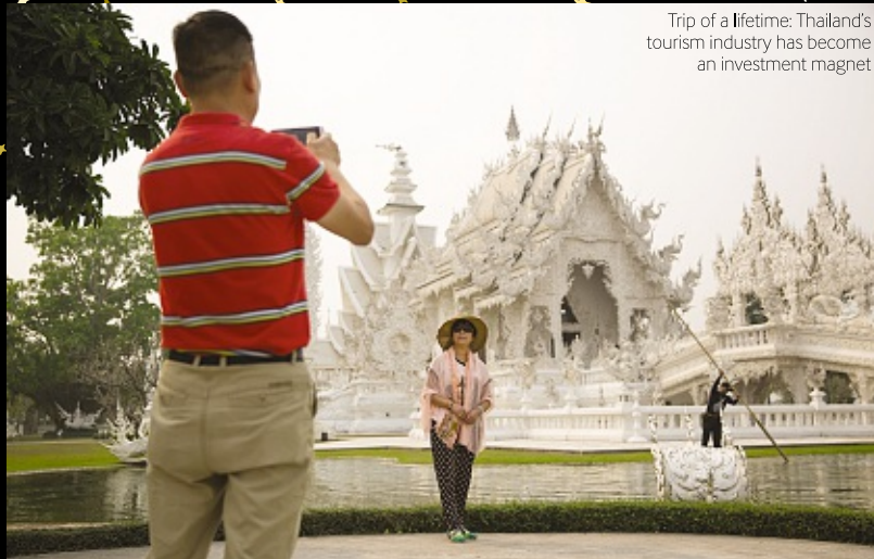
Trip of a lifetime: Thailand's tourism industry has become an investment magnet

To create a shortlist for 'fDi Tourism Locations of the Future 2017/18', the fDi Intelligence division of the