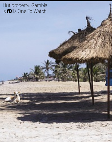
Hut property: Gambia is fDi's One To Watch